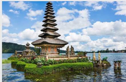
Temple in Bali