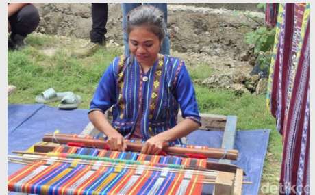
An NTT woman weaving manually

Within driving distance you can enjoy world class museums and orchestra concerts along with zoos, aquariums, malls and an international airport for when family and friends come to visit. Within a few hours drive you can easily reach a beach that is family friendly or head to the mountains for hikes in the mountains. Within a few short hours by plane you can enjoy some of the most beautiful beaches in the world along with crystal clear snorkeling along Indonesia's beautiful coral reefs. Bali is a world renowned vacation spot that is located in Indonesia and only a short flight away from Jakarta.